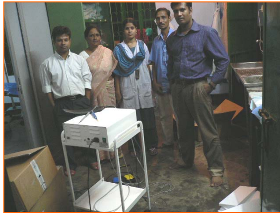
Diathermia Machine for the hospital

In accordance with Max Foundation & Alosikha Foundation donated a Diathermia Machine to the Alosikha hospital that creating opportunity towards the patients during operation period for blood coagulating