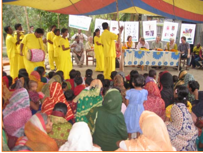
Culture show (pop song)