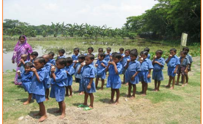
Children for nutrition Feeding program