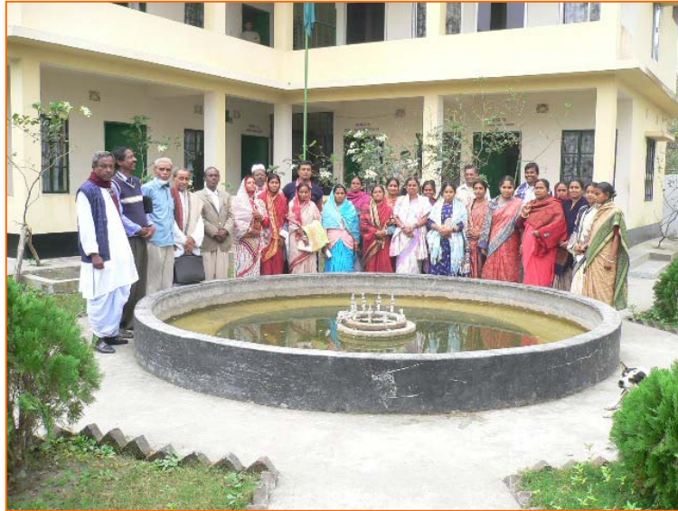
Civil society training

5 Workshops were organized with civil society members during the reporting period. Branch offices organized these workshops. A total of 250 civil society representatives attended these workshops. Issues like 100% sanitation coverage in the target area, hygiene practices, arsenic, HIV AIDS, etc. were discussed in these workshops. Field Coordinators facilitated the workshops