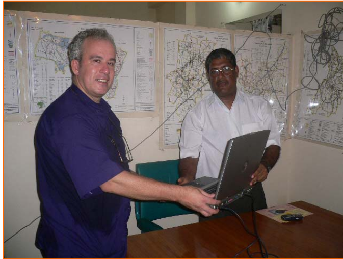
Chairman of Aloshikha foundation donated a laptop to the Executive Director