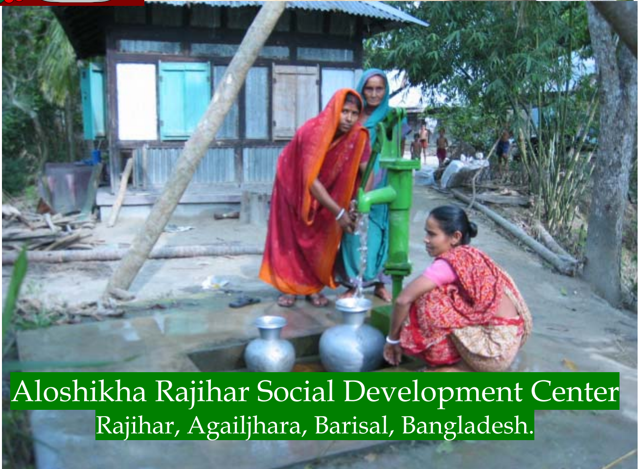
Aloshikha Rajihar Social Development Center Rajihar, Agailjhara, Barisal, Bangladesh.