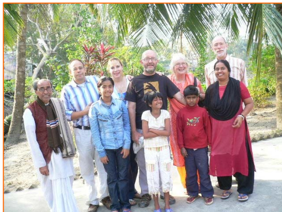
A group of specialists are seen from Netherlands and they organized a seven-day medical services surrounding people of Aloshikha