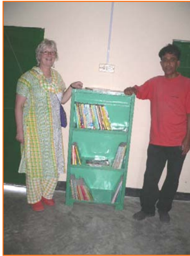
Opened Kindergarten school Library