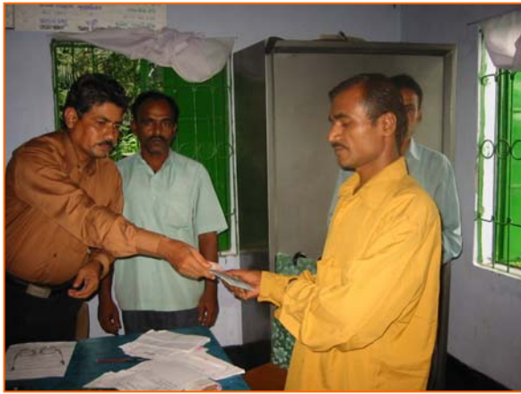
Receiving cash a group member