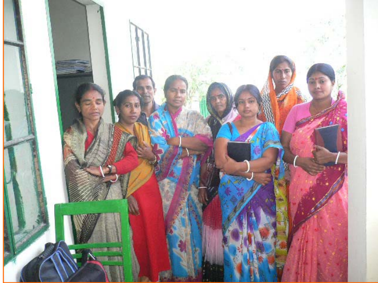
Eight health motivators are seen

We have continued to receive support from SAKO Foundation that has seen the strengthening of the capacity of our Health Motivators in their outreach work. Mr. Sjef Verwilghen & Mrs Sjef verwilghen from The Netherlands visited Alosikha in February 2007. In the light of their visits to take the feedback of the community based health activities through field visits with health motivators and seen them at a nutrition camp in the village. Last years Alosikha was organized 12 nutrition camps at different villages among malnourished babies where 370 malnourished babies mothers were presence during nutrition camps. We motivated of the mothers about malnourished cause and consequences.