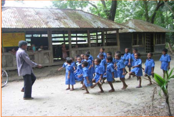
A teacher pity for pre-school children

In the 40 pre-schools, 1200 students fulfilled their final examination in December 07. Through the satisfactory result of this examination 98% of the parents knew that education is essential part of life. In our 40 pre-schools about 1200 students are getting quality by our competent teachers as well as free medical check-up, quality sanitation and hygiene facilities and nutritious feeding facilities. Our pre-school program is being continued supported by SK Foundation (the Netherlands). Aloshikha also offers a feeding programme for children where they are feeding milk and eggs four times in a week, where Aloshikha can be ensured a good child growth and nutrition deficiency. This avails a chance to children who come from poor families that cannot afford these basic foods to have an opportunity of eating nutrition foods.