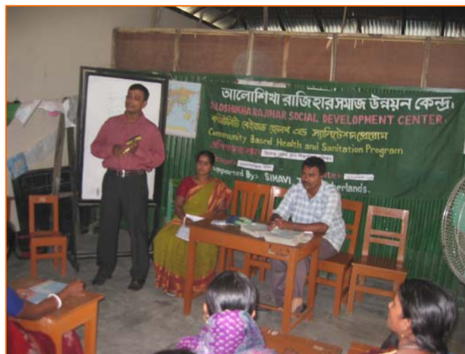
Advocacy workshop with LGLS training

Soft ware program: Advocacy workshop with LGLS training