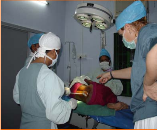
Being prepared for caesarian