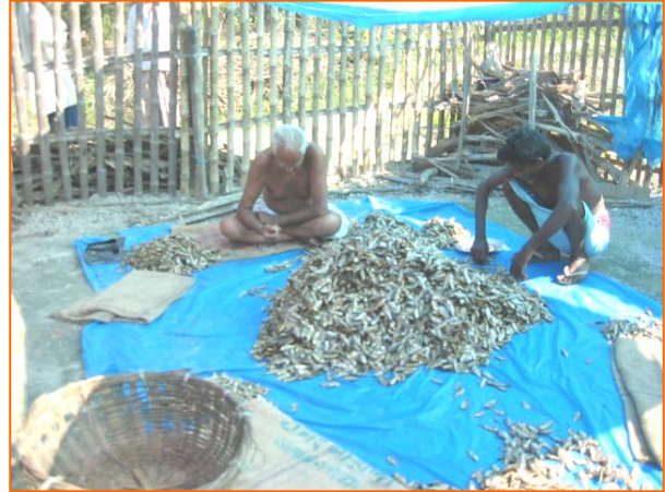
Fish drying an income generating project