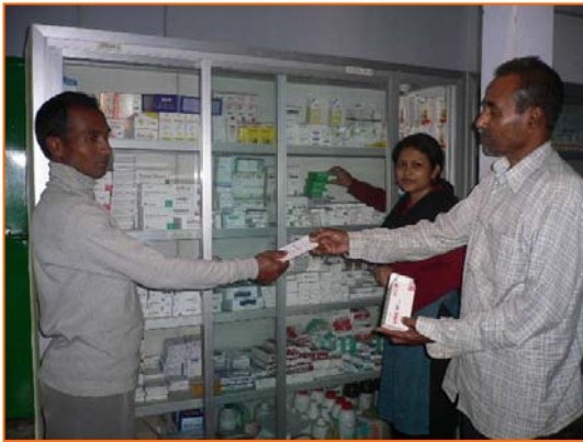
Medicine for the outdoor indoor and patients