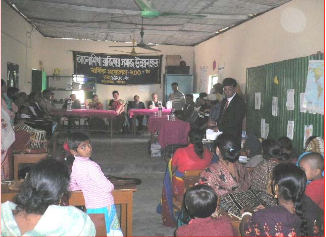
Yearly staffs conference for 2007