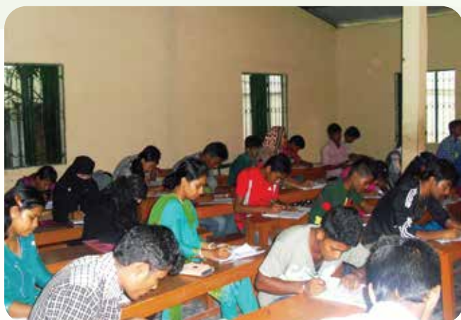
Class Nine : Examination ( 2015)