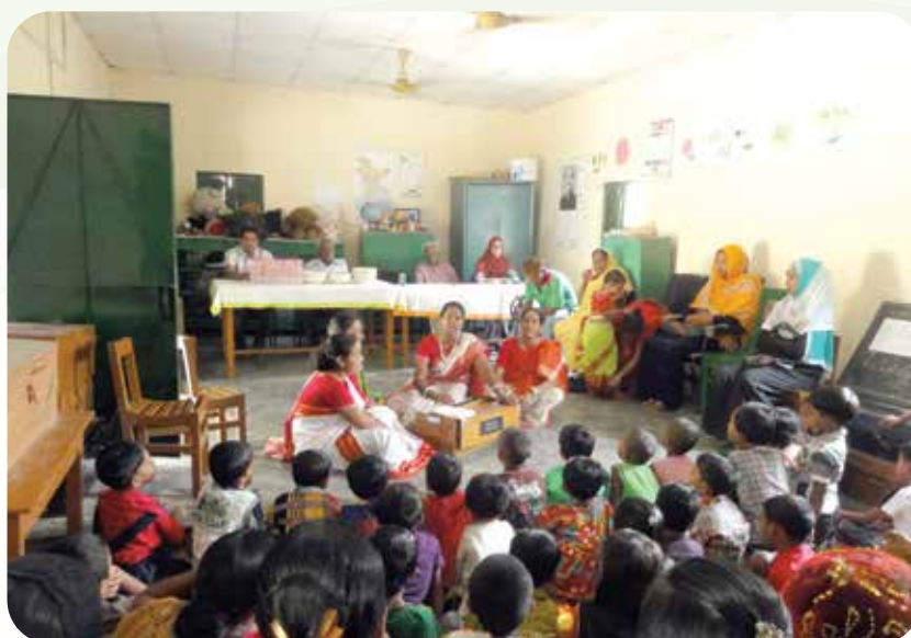
Cultural activities for Children