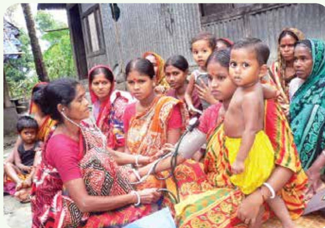
Hotchpotch cooked at Nutrition Camp for malnourished children

The Aloshikha RSD Center is always prioritizing the child health care and nutrition's deficiency. To eliminate the child immortality and male nutrition, ALOSHIKHA has taken initiative and log run scheme called “Integrated Rural Health Support Programme” for the remote villagers to build-up awareness, process to take nutritional food using the local vegetable and food resources. This IRHSP underpinning programme is funded SAKO Foundation ( The Netherlands) to strengthening the capacity of outreach works, Health Motivators to mobilize the vulnerable villagers . Aloshikha is operating the IRHSP programme under the following activities: