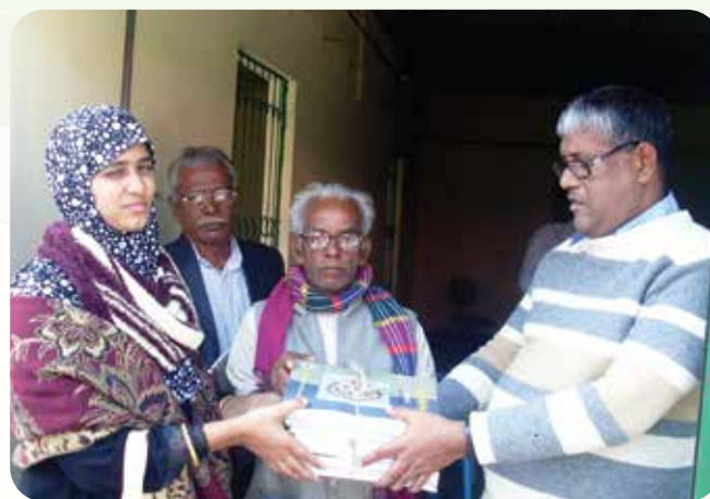
Book Distribution for class Nine-2015