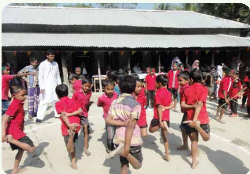
Student games: Kabady is performing.

Aloshikha believes that education is important for all and without education none can take part to the Nation building process. Kindergarten school education is greatly contributing to achieve quality education for children.. The Kindergarten education system is bit costly rather than formal primary education in rural context. The Aloshikha has set-up one kindergarten school in its campus and getting very popular in the locality. Aloshikha has expended the kindergarten schooling programme over Barisal District and set-up three kindergarten schools in different places. The main focus of the program is to ensure quality education with creativity activities on regular basis for pupils cognitive development. Aloshikha is also organizing consultation sessions with parent to discuss about pupils learning progress, home task, challenges, school service feedback etc. issues in quarterly. Most of the Kindergarten schools are mainly academic oriented and we are different and putting little emphasis on extra curriculum activities among the students to learn awareness and raise voice against the child abuse and child trafficking and their rights, road safety and to promoting cultural heritage.