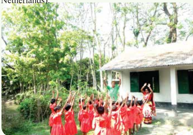
New Uniform for the pre-school children

1. Aloshikha is operating pre- primary school under a programme called “PRIMA” over different part of Rajihar, Barisal, Madaripur and Gopalganj district since last 16 years. Aloshikha has established 41 pre-primary schools and enrolled more than 1230 students. 98 % of students are successfully completed final examination and achieved literacy programme to get admission into formal primary schools. PRIMA school is operating with 30 students age about 5-6 and course duration of two years only. During the learning period children are being better informed about their rights and abusing of child labor and trafficking and related issues. Pupils are getting free medical check-up, quality sanitation and hygiene facilities and nutritional school feeding options (4 time foods for each student). This programme is running by SK Foundation (The Netherlands).