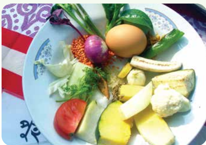
Nurtured Green Vegetables at Nutrition camp