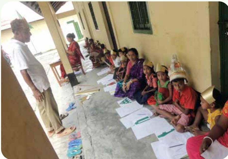
The children drawing to Creativity materials for use