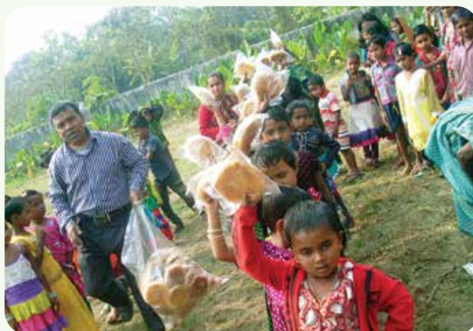
Feeding program for pre-school students