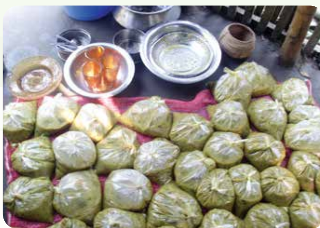
Health motivator & supervisors are gathering together with mother and children for motivation with the nutritious food and displaying the different card