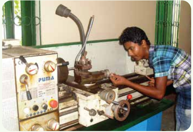
A young mechanical learner is doing the practical practice.