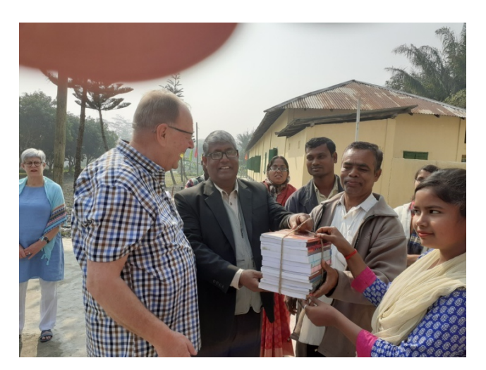
Book distribution ceremony

The SAKO foundation chairman recently paid visit to Aloshikha VTC and distributed books among the student. The board members of SAKO also conducted training the students on English. The students' gifted photos on their farewell by the ED of Aloshikha.