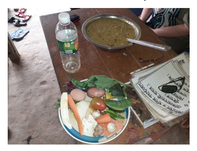
Green vegetable are processing before

A team on 29<sup>th</sup> January 2020 visited Aloshikha RSDC Center to monitor the child health care and nutrition camp. The program is funded by the SAKO Foundation the Netherlands, which continue to help us to work for health motivators to address the plight and problem of child health care services at field level. In the light of their visits to take the feedback of the community based health activities through field visits with health motivators and organizing the nutrition camp in the village. This year Aloshikha was organized 10 nutrition camps at different villages among malnourished babies where 300 malnourished mothers were present during nutrition camps. Aloshikha motivated to the mothers about the cause malnutrition and its consequences.