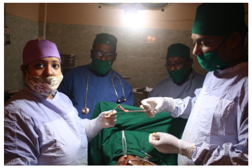
Maria Mother General Hospital patients' statistic: