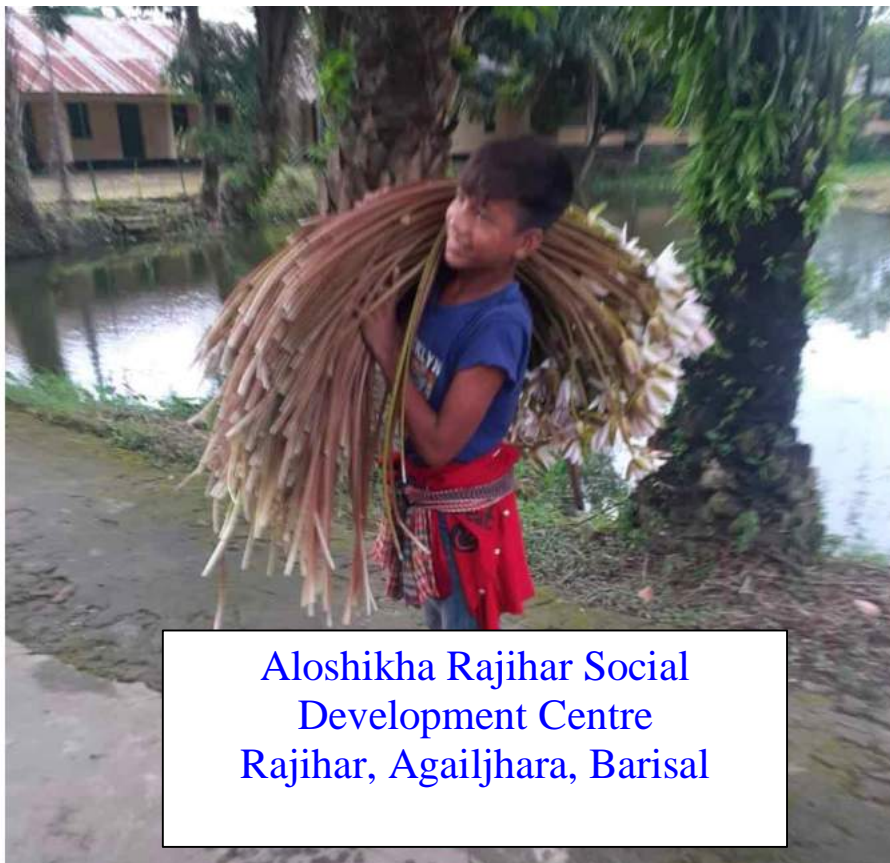
Aloshikha Rajihar Social Development Centre Rajihar, Agailjhara, Barisal