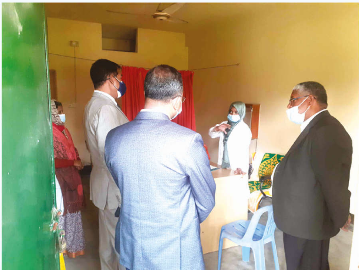
Director General of NGO Affairs Bureau is inspecting and discussing with the Gyn Doctor of the hospital