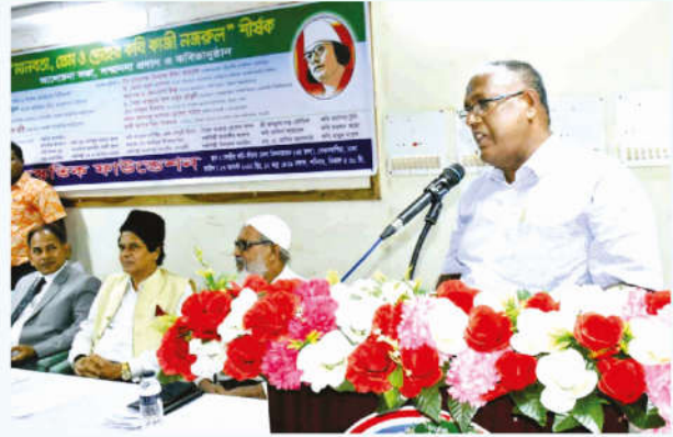
27 August 2022 Reward ceremony Dhaka press club