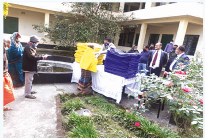
Aloshikha Program Blanket Distributed to the NGO bureau director general