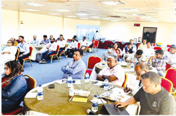
NGO Forum Coxbazer 9th November, 22