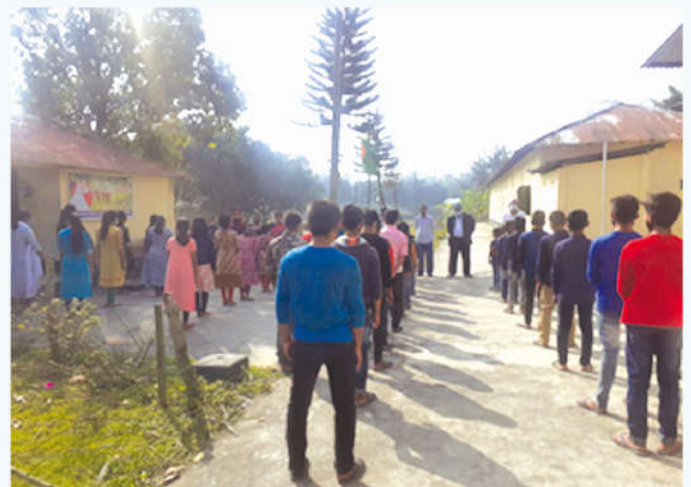
The student are in morning prayer