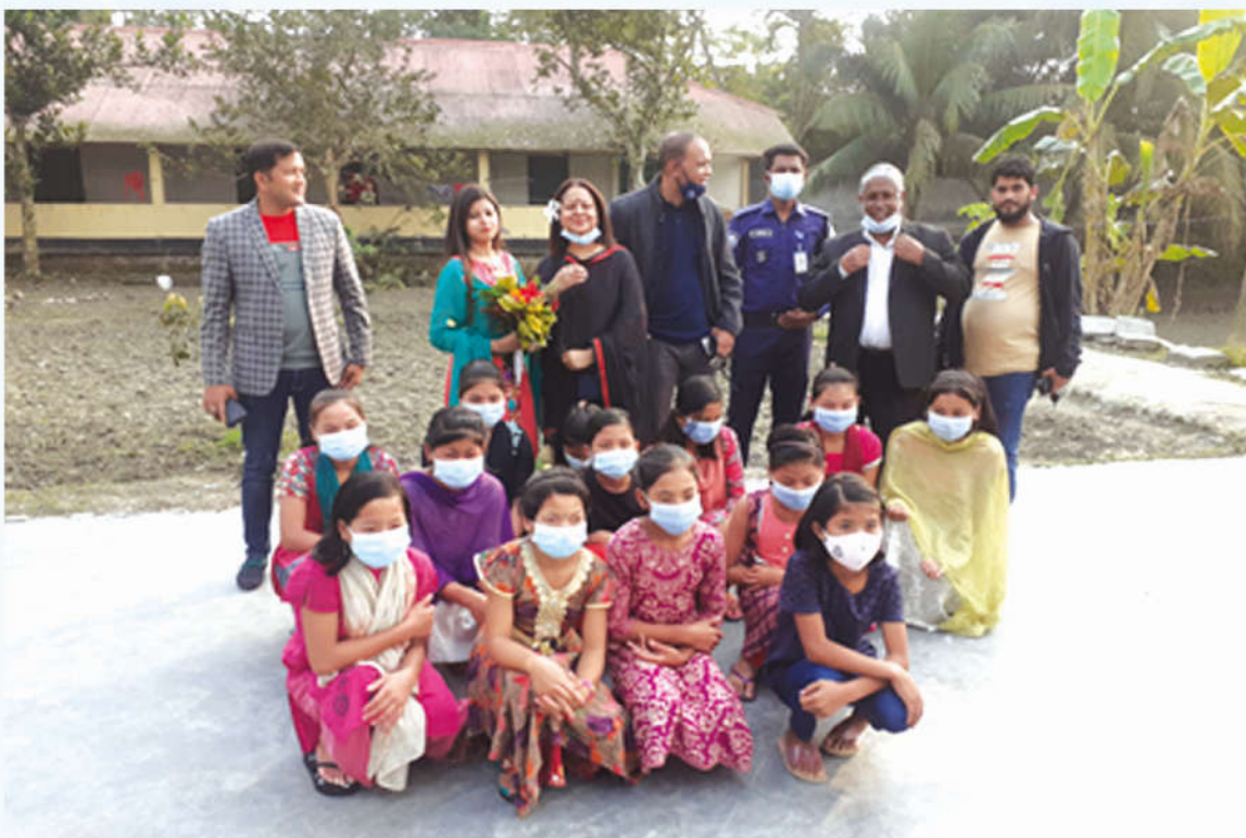
SP of Barishal along with OC (investigation) visited Aloshikha office on January 1, 2022 and met some boarders of Orphanage home.