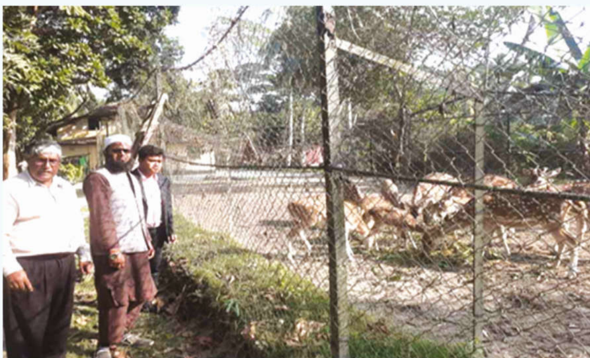
Visit to Upazila Livestock officer and ICT officer Aloshekha deer farm