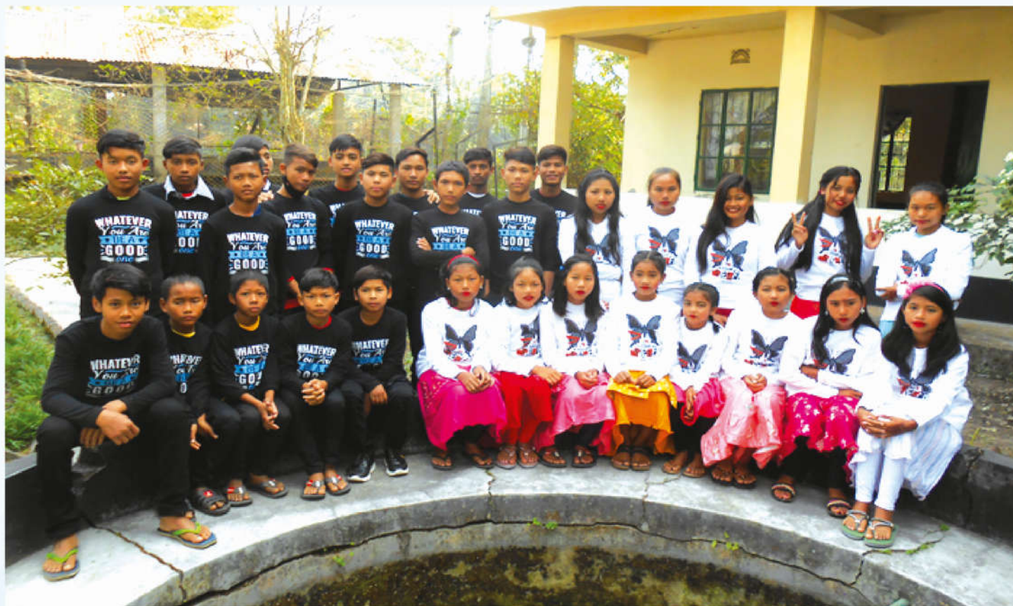
Groups picture for the orphan children