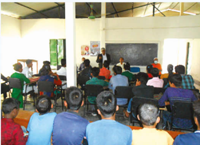
The students are attending Vocational Exam.

The Aloshikha Vocational Training Center is duly affiliated by the Bangladesh Technical Education Board. The Center was recently affiliated as SSC Vocational Course. The Board has the responsibility to support to the center with logistic and other amenities.