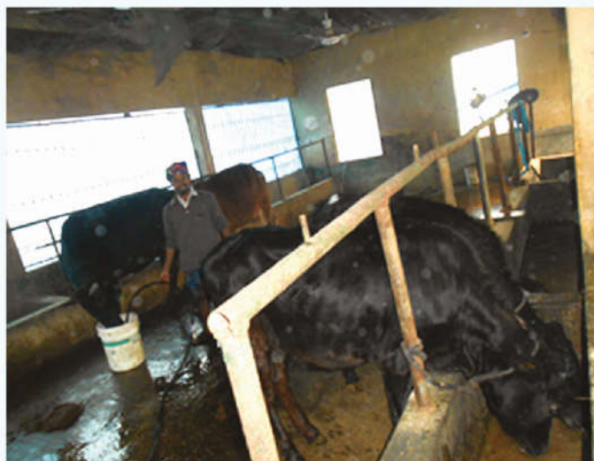
Looking after cow rearing