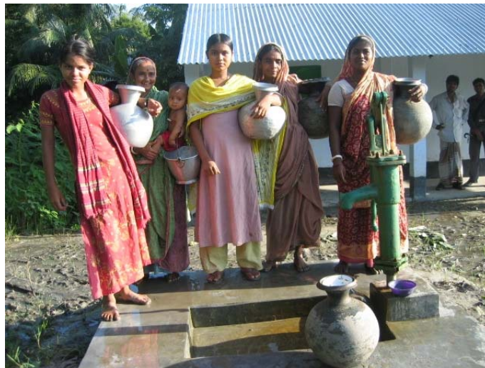
Peoples enjoying drinking water after set-up a Deep tube well

For the project deep tube-wells (DTWs) have been installed in the different areas under three districts of Aloshikha. It cost Tk.38,000 to install each DTW of which community people share was Tk.8,000. A local contractor who nominated by Aloshikha and installation the DTWs with active participation of the community people.