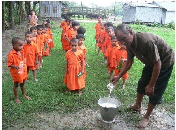
Feeding program for pre-school students