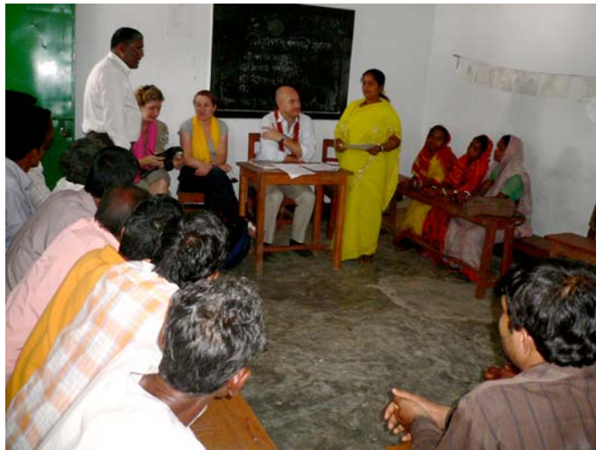
Advocacy workshop with (LGLS) training

One batch of training on gender development was organized by the Aloshikha staff. The training was held at the head office of Aloshikha 28 nos. of selected staff had participated in the training. Main contents in this training were evolving role of men and women and gender discrimination, women rights and women empowerment, gender violence and sexual harassment of women, etc. The training was conducted by Aloshikha Training Coordinator and one facilitator from Dhaka. The duration of this training was Seven days long.