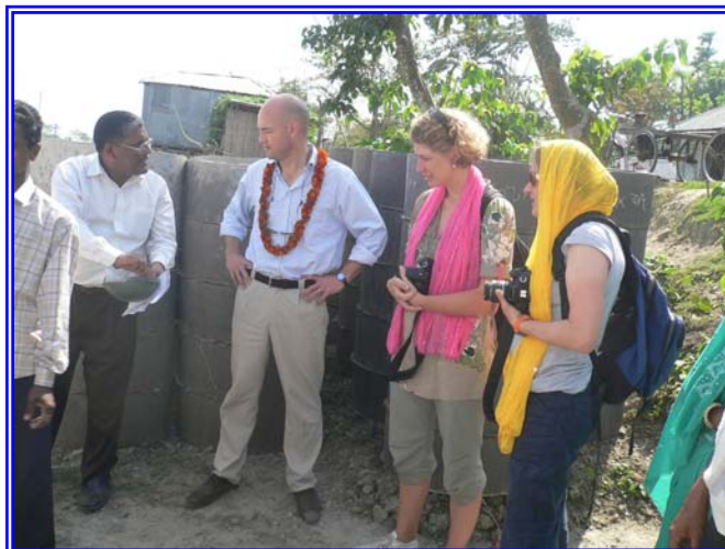
latrine distribution by the health facilitator

Installation of community latrine is one of the key activities of this project. In the period a total of 600 latrine (5 rings and 1 slab) sets have been distributed from the project. Aloshikha setup its own facilities at the branch office level for the production of latrine materials (ring and slab) recruiting local masons. Aloshikha distributed the rings and slab free of costs; where the community people shared all other costs such as carrying costs, installation costs and the costs for construction of shed and fence. For each community latrine, a committee has been formed to oversee the maintenance of the latrines.