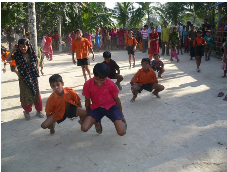
Satla Nayakandi kindergarten school