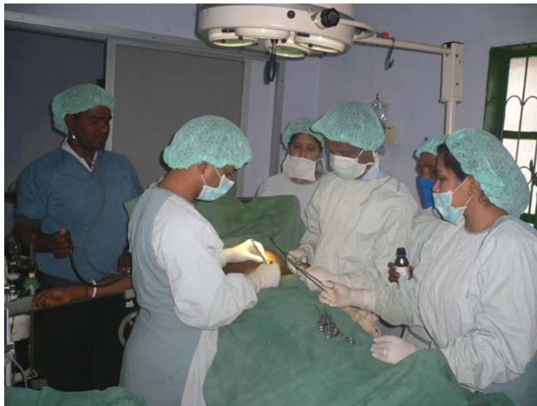
Being prepared for caesarian