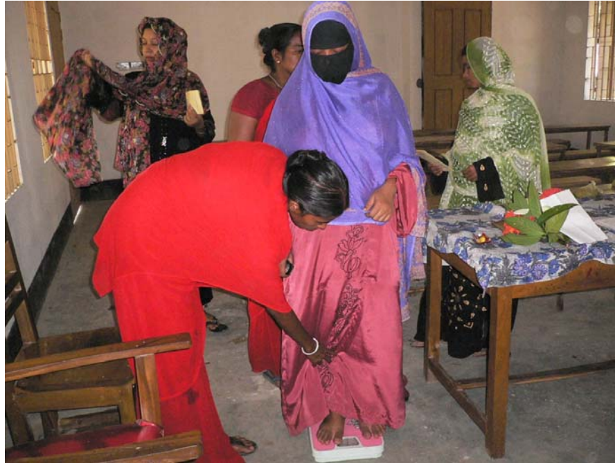
Health Motivator carefully measuring weight of pregnant mother.

The Aloshikha RSD Center always gives more emphasis towards the child health care and nutrition's deficiency. In order to the Organization had an opportunity to receive continue support from SAKO Foundation that has obviously strengthening the capacity of outreach works among our Health Motivators. In the light of their visits to take the feedback of the community based health activities through field visits with health motivators and organizing the nutrition camp in the village. Last years Aloshikha was organized 12 nutrition camps at different villages among malnourished babies where 360 malnourished mothers were presence during nutrition camps. We motivated to the mothers about malnourished cause and consequences.