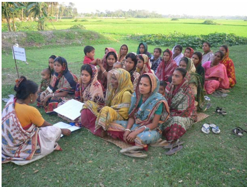
Village health club training (VHC)

To strengthen the sanitation and hygiene movement in Bangladesh, Aloshikha also organizes workshop with the civil society in the working areas. In our on going project, a total of five (5) workshops were organized as such with the civil society members whereby a total of 150 civil society members came to informed and motivated about their role and responsibilities in attaining environmental hygiene and sanitation in the community. Aloshikha Field Coordinators facilitated the workshop with the civil society.