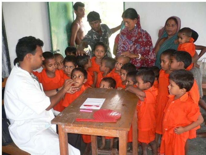
Doctor checking the pre-school students