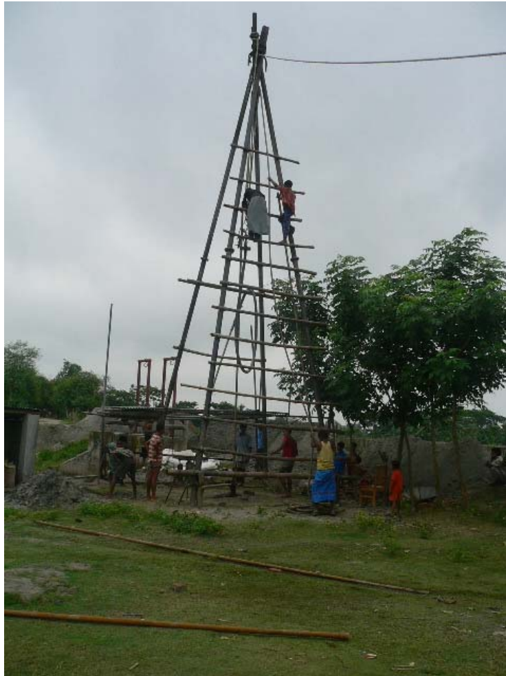
Deep tube well Installation system

For the project deep tube-wells (DTWs) have been installed in the different areas under three districts of Aloshikha. It cost Tk.38,000 to install each DTW of which community people share was Tk.8,000. A local contractor who nominated by Aloshikha and installation the DTWs with active participation of the community people.