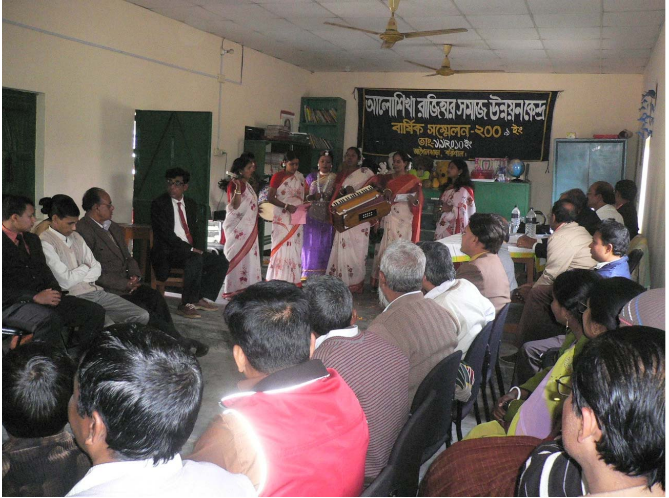
Yearly staff's conference for 2009