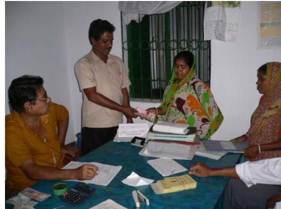
Receiving cash a group member