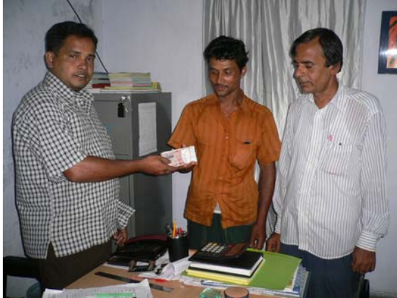
Tailoring for income generating project

The integrated approach of Aloshikha makes it possible to give a broad support to micro-credit beneficiaries. Not only practical training on small business activities, technical training and support are given by Aloshikha, but also preventive, primary and curative healthcare are offered by Aloshikha. Many children of micro-credit group members are attending Aloshikha pre-schools.