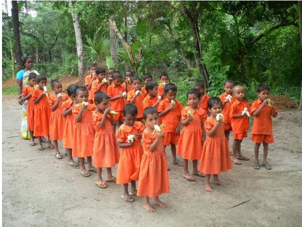
Students Pity for pre-school children

Aloshikha is continuing 40 pre-schools since long and number of the students 1200. In our 40 pre-schools about 1200 students are getting quality of education by our competent teachers as well as free medical check-up, quality sanitation and hygiene facilities and nutritious feeding facilities. Our pre-school program is being continued supported by SK Foundation (the Netherlands). Aloshikha also offers a feeding programme for children where they are feeding milk and eggs four times in a week for ensure the nutrition deficiency.