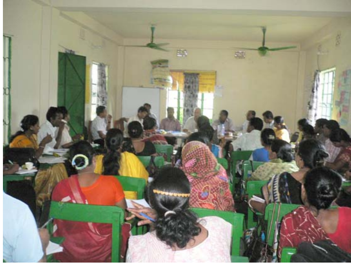
Staff Development training

One batch of training on gender development was organized by the Aloshikha staff. The training was held at the head office of Aloshikha 28 nos. of selected staff had participated in the training. Main contents in this training were evolving role of men and women and gender discrimination, women rights and women empowerment, gender violence and sexual harassment of women, etc. The training was conducted by Aloshikha Training Coordinator and one facilitator from Dhaka. The duration of this training was Seven days long.