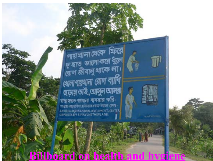
Billboard on health and hygiene

Installation of community latrine is one of the key activities of this project. In the period a total of 600 latrine (5 rings and 1 slab) sets have been distributed from the project. Aloshikha setup its own facilities at the branch office level for the production of latrine materials (ring and slab) recruiting local masons. Aloshikha distributed the rings and slab free of costs; where the community people shared all other costs such as carrying costs, installation costs and the costs for construction of shed and fence. For each community latrine, a committee has been formed to oversee the maintenance of the latrines.