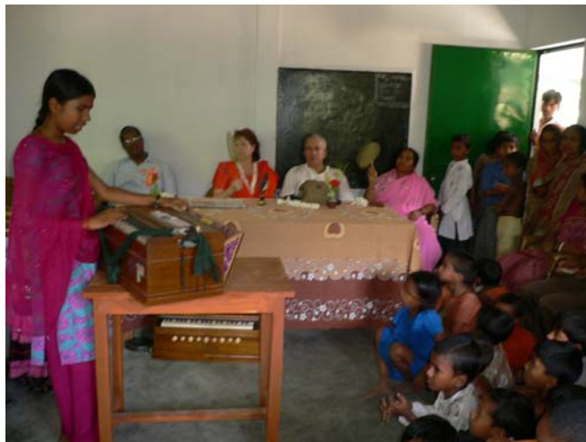
Maria Child Care Biddanikaton (Rajihar).

In 2009 Maria child Care Biddanikaton had an opportunity to receive 110 numbers of students and still trying to provide them as quality education and included creativity activities on regular basis. A parents meeting was held on school premises yearly 3 times with a view to quality education. In Bangladesh all the Kindergarten schools are mainly academic oriented and we put little emphasis on extra curricular activities towards the students.