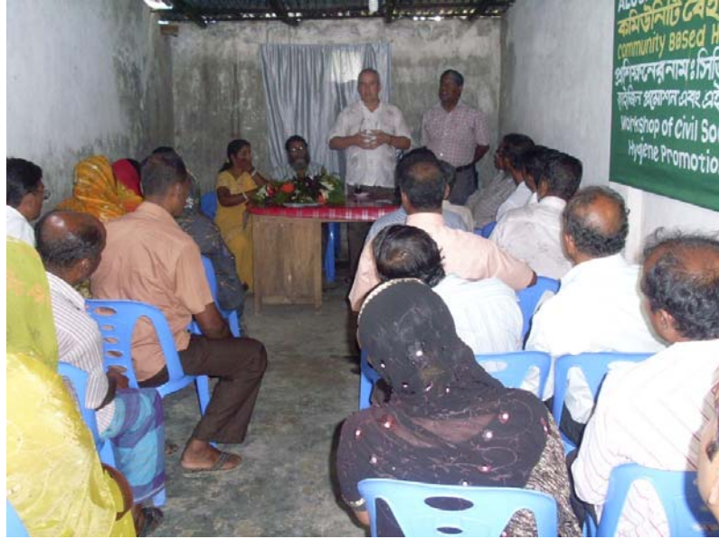
Civil society training

To strengthen the sanitation and hygiene movement in Bangladesh, Aloshikha also organizes workshop with the civil society in the working areas. In our on going project, a total of five (5) workshops were organized as such with the civil society members whereby a total of 150 civil society members came to informed and motivated about their role and responsibilities in attaining environmental hygiene and sanitation in the community. Aloshikha Field Coordinators facilitated the workshop with the civil society.