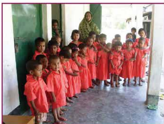
New Uniform for the pre-school children

It goes back 15 years the Aloshikha is operating 41 pre schools in the different part of the Barisal district. According to provision of the project every pre school have 30 children age about 5 to 6 and course duration of two years only. It is estimated that after two years of learning about 600 children able to admitted to the government primary school. During the learning period children were better informed about their rights and abuse and child labor and trafficking and related issues. In our 41 pre school a total of 1230 children were enrolled every day during school period. They are getting free medical check up and quality sanitation and hygiene facilities and nutritious feeding facilities.