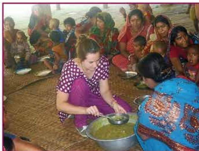
Hotchpotch cooked on at Nutrition Camp for malnourished children

The Alosikhya RSDC enter always gives more emphasis towards the child health care and nutrition's deficiency. The program is funded by the SAKO Foundation the Netherlands which continue to help us to work for health motivators to address the plight and problem of child health care services at field level. In the light of their visits to take the feedback of the community based health activities through field visits with health motivators and organizing the nutrition camp in the village. This year Alosikhya was organized 12 nutrition camps at different villages among malnourished babies where 372 malnourished mothers were present during nutrition camps. We motivated to the mothers about the cause malnutrition and its consequences