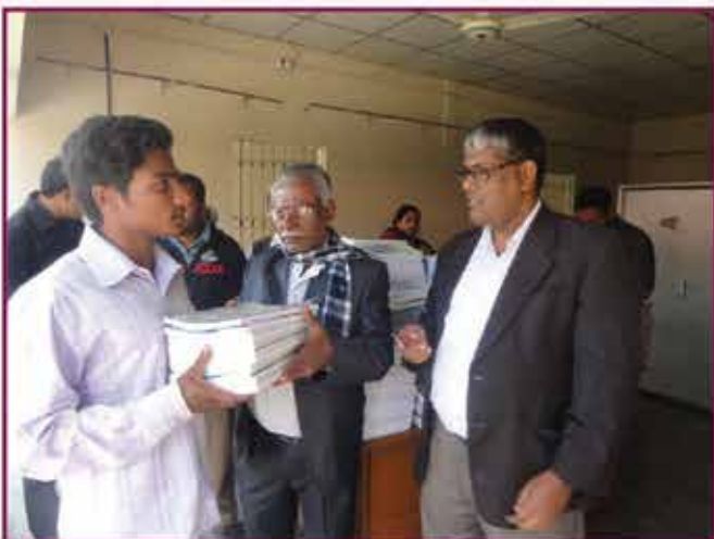
Book distribution 2014 for the VTC students