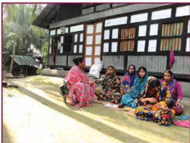
Checked-up pregnant mother with motivational work.