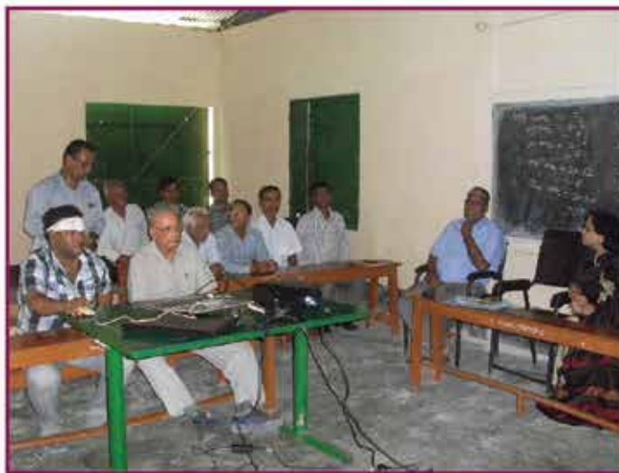
Teacher's Monthly Meeting