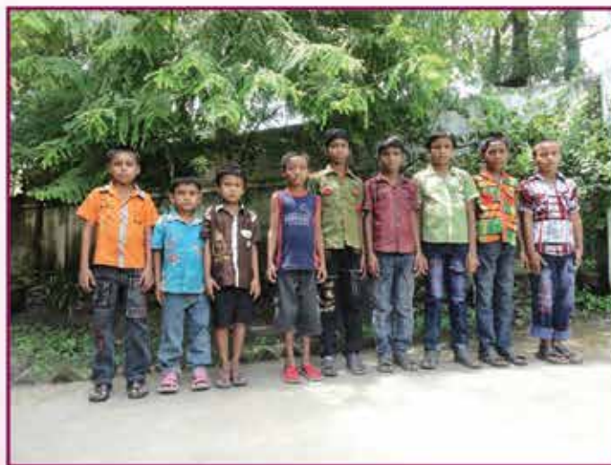
10 MMPS Orphan Children

MMPS Homes for street children program actually started early November 2014 with 10 street kids and have an excellent accommodation and education facilities. Primarily the program is running on with its limited financial capacities with contribution of individual and or local supports are the prime source of the program. It is needless to say that donor support should strongly need to be program success.