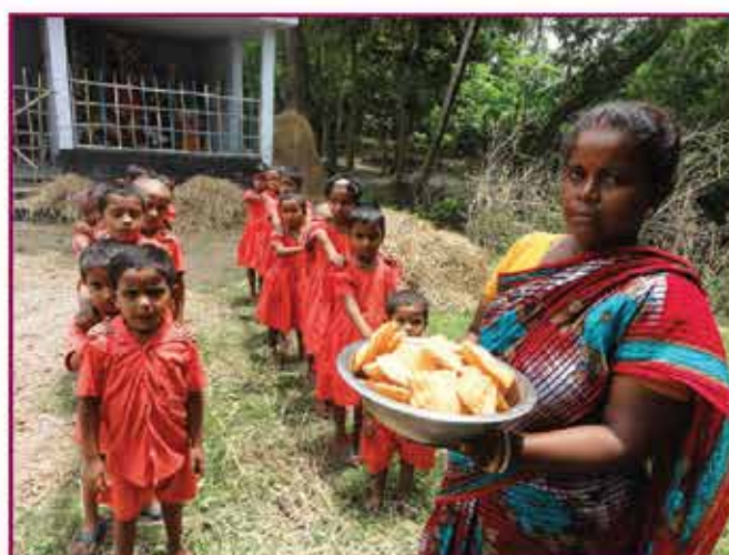
Feeding program for pre-school students