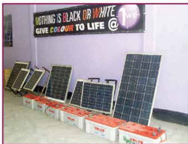
List of Solar distribution - 2014