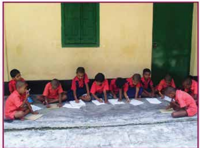
The children drawing to Creativity materials for use