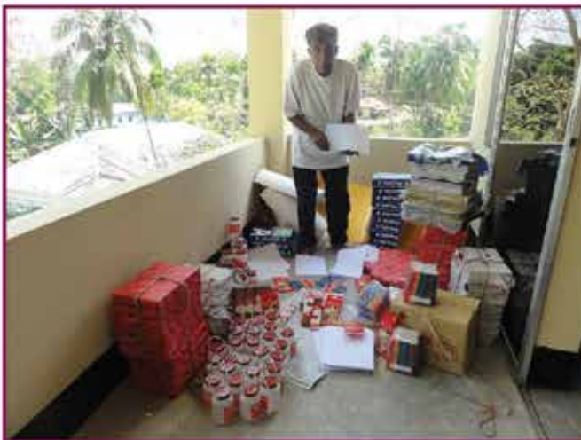
Deposit to Creativity materials

The creative activities for preschool are a comprehensive collection of knowledge building and daily practice resources. However, very recently Mrs ANS Beek one of senior expert and volunteer from PUM the Netherlands visited Aloshikha and exclusively supported to creativity program in to the preschool for cognitive development for preschool children.