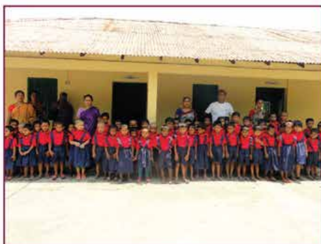
UNO Wife distribute the new school dress