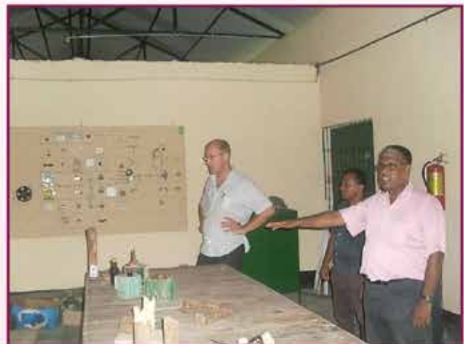
Visit to Marteen Electrical trade

The Alosikha Vocational Training Center is duly affiliated by the Bangladesh Technical Education Board. The Board has the responsibility to support to the center as to their provision as logistic and others support. In view of book distribution has completed among students of the vocational training center recently.