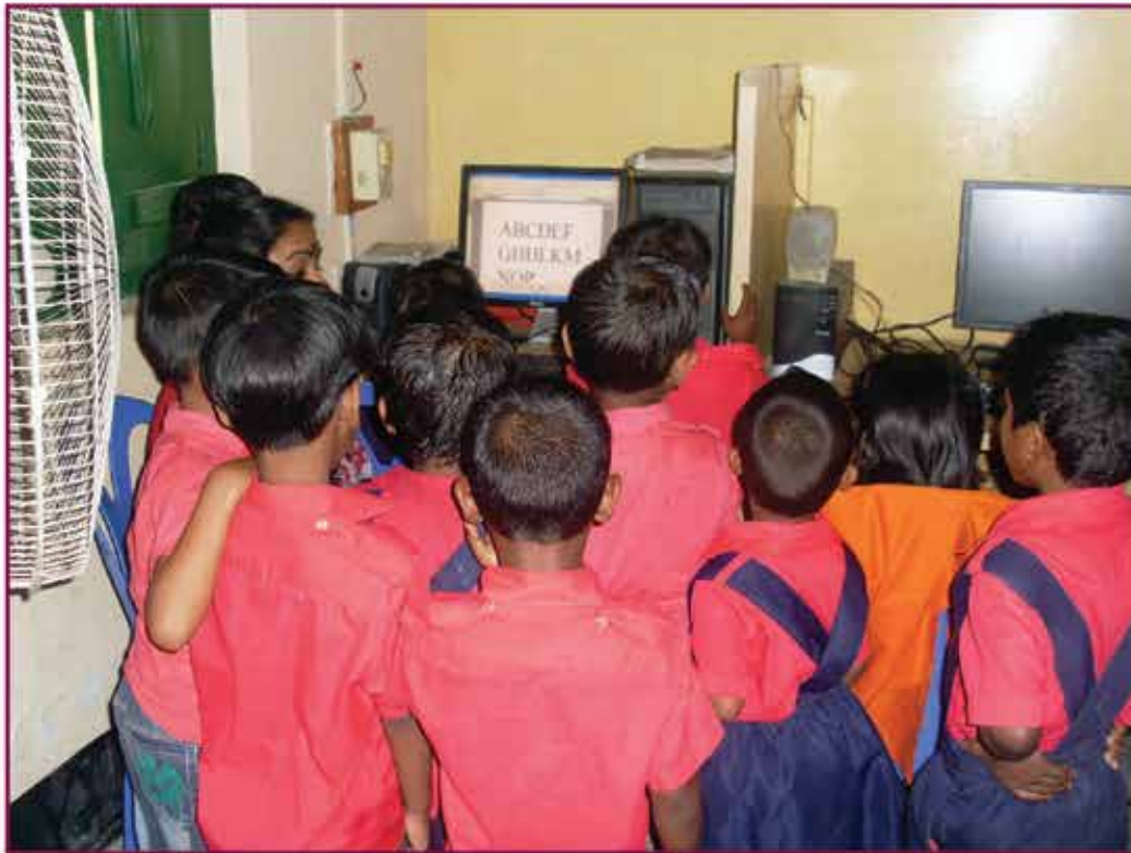
Computer training is going on for the school children