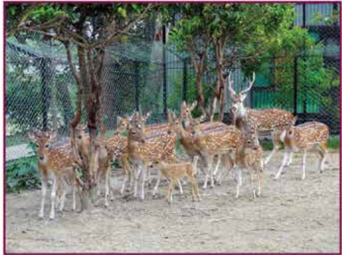
Inspector and Research Officer visit Deer Conservation Centre and approved Firming License