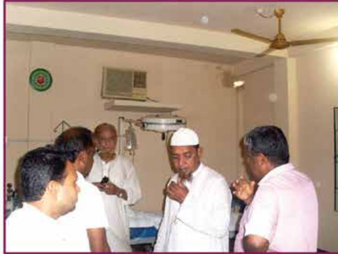
Civil Surgeon's visit to Maria Mother General Hospital