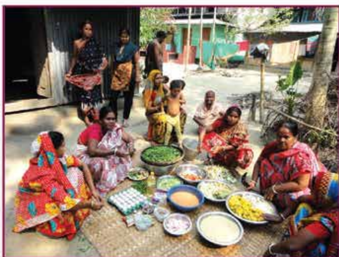
Green vegetable are processing before Nutrition camp

The Alosikhya RSDC enter always gives more emphasis towards the child health care and nutrition's deficiency. The program is funded by the SAKO Foundation the Netherlands which continue to help us to work for health motivators to address the plight and problem of child health care services at field level. In the light of their visits to take the feedback of the community based health activities through field visits with health motivators and organizing the nutrition camp in the village. This year Alosikhya was organized 12 nutrition camps at different villages among malnourished babies where 372 malnourished mothers were present during nutrition camps. We motivated to the mothers about the cause malnutrition and its consequences