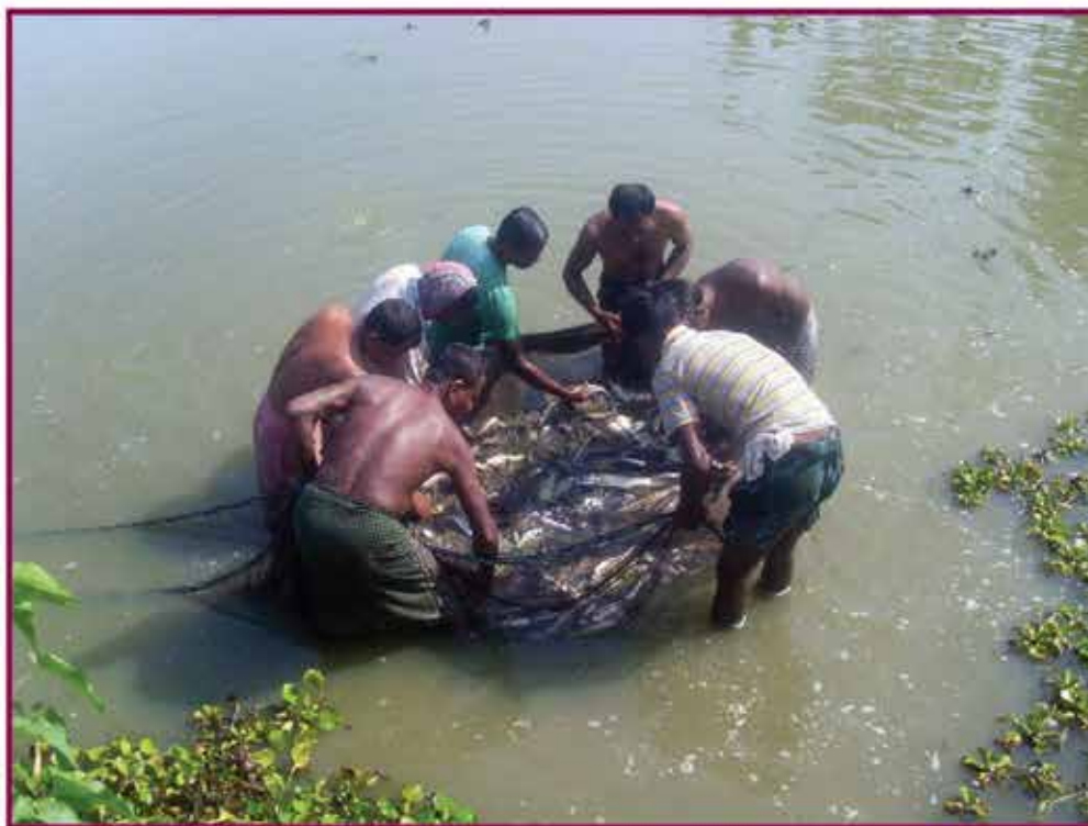
Aloshikha Fishing Program

The fish play an important role in the Bangladeshi diet constituting the main and often irreplaceable animal protein source in poor rural households. The study addressed the dietary contribution of fish to vitamin A, calcium and iron intakes and the potential of integrating small indigenous fishes. In the light of the Aloshikha has undertaken fish cultivation program in its own water bodies both the high varieties and local indigenous species.