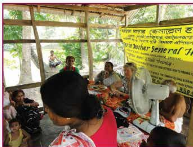
Health motivator & supervisor gathering together with mother and children for motivation the nutritious food and display the different card

The resistance fund one of an emergency support for medical treatment and actually who is financially stagnant and economically vulnerable or dose not affordable to manage medicine. Alosikhya has received a resistance fund from the SAKO Foundation (The Netherlands) for which vulnerable local people can overcome the emergency situation easily. In the last year we able to provided medicine for treatment and cash money among the at least 419 vulnerable people in the community.