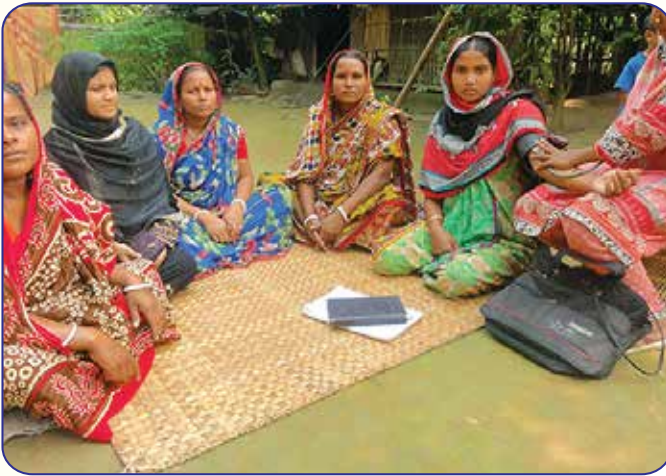
Checked-up pregnant mother with motivational work.

The Aloshikha RSD center is always prioritizing the child health care and nutrition's deficiency. To eliminate the child mortality and malnutrition, Aloshikha RSD Center has taken initiative and long run programme called "Integrated Rural Health Support Programme" for the remote villagers. The key aims of the programme is to build-up awareness, process to take nutritional food using the local vegetables (yard gardening) and food resources. This program is funded by the SAKO Foundation, the Netherlands to strengthening the capacity of out-reach workers. Our health motivators are organizing nutrition campaign at field level to address the plight and problem of child health care services. This year Aloshikha has organized 12 nutrition camps at different villages among malnourished babies and mothers, where 372 malnourished mothers were present during nutrition camps.