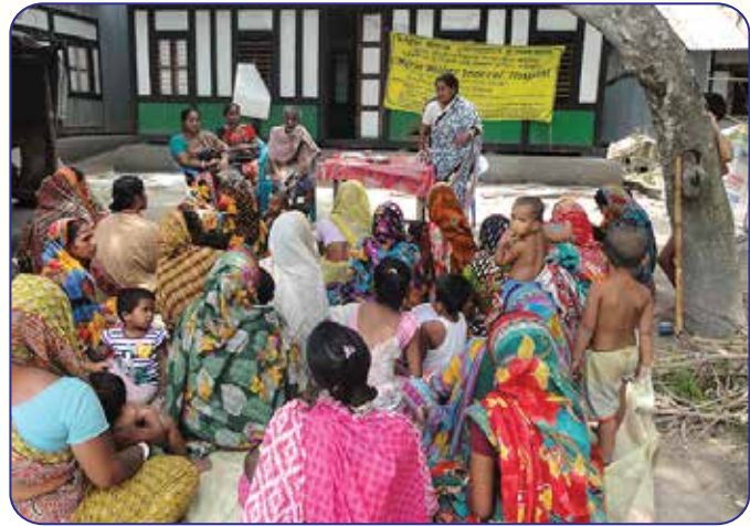
Health motivator & supervisor gathering together with mother and children for motivation the nutritious food and display the different card.