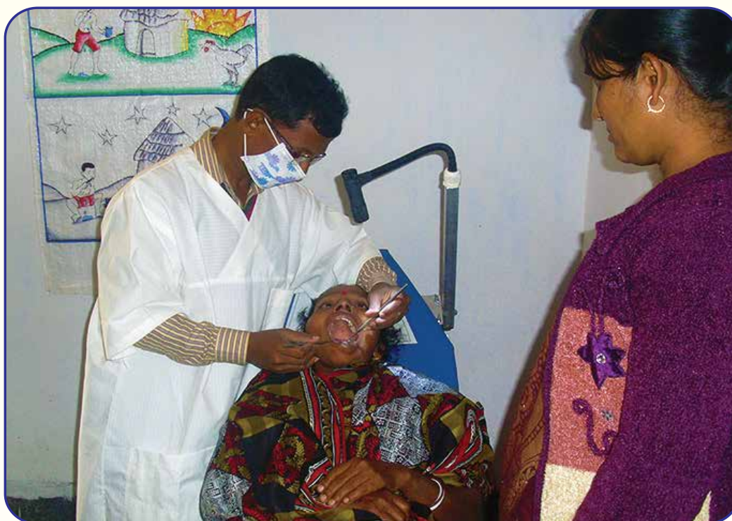
Sub center of Pিরerbari.

The Aloshikha Dental Clinic has established to build-up the bridge to provide dental care services for both the Urban and Rural communities. The Dental Clinic is located at Rajihar village under Agail-jhara Upazila in Bangladesh,