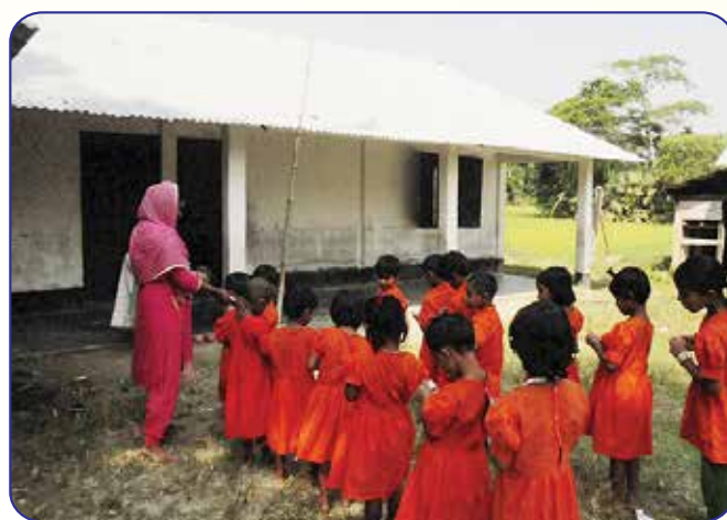
New Uniform for the pre-school children