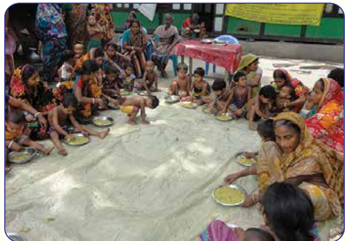
Hotchpotch cooked on at Nutrition Camp for malnourished children.