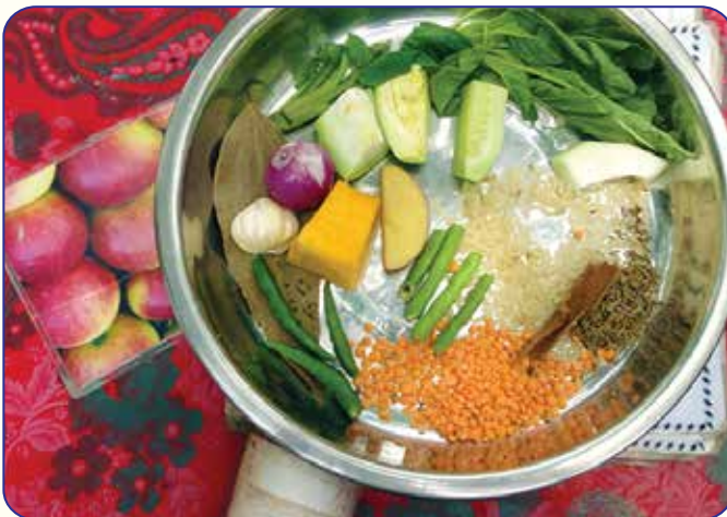
Green vegetable are processing before Nutrition camp