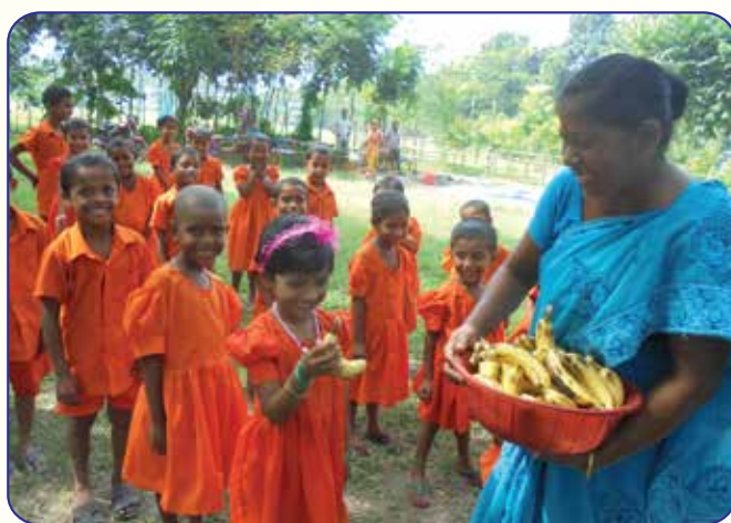
Feeding program for pre-school students

Aloshikha RSD center is operating pre-school under a programme called “PRIMA” over different part of Rajihar Upazila, in Barisal., Madaripur and Gopalganj district since last 16 years. We have established 41 pre-schools and enrolled more than 1230 students in total. 98% students have successfully completed final examination and achieved literacy programme to get admission into formal primary schools. 30 Children age about 5 to 6 per school is getting admission according the PRIMA project provision and the course duration is two years only. This pre-school programme is designed to improve learning knowledge in various common issues such as child rights and abusing, child labour and it’s bad impact including literacy and numeracy through participatory learning methods, so that after two years about 600 children able to admit to the government primary school. Aloshikha is providing free medical check up and quality sanitation and hygiene facilities and nutritious feeding to children through PRIMA programme.