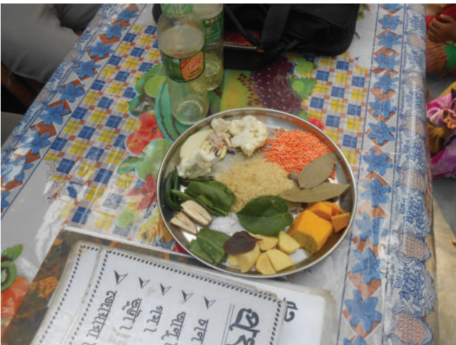
Green vegetable are processing before Nutrition camp

The Aloshikha RSDC enter always gives more emphasis towards the child health care and nutrition's deficiency. The program is funded by the SAKO Foundation the Netherlands, which continue to help us to work for health motivators to address the plight and problem of child health care services at field level. In the light of their visits to take the feedback of the community based health activities through field visits with health motivators and organizing the nutrition camp in the village. This year Aloshikha was organized 12 nutrition camps at different villages among malnourished babies where 365 malnourished mothers were present during nutrition camps. We motivated to the mothers about the cause malnutrition and its consequences.