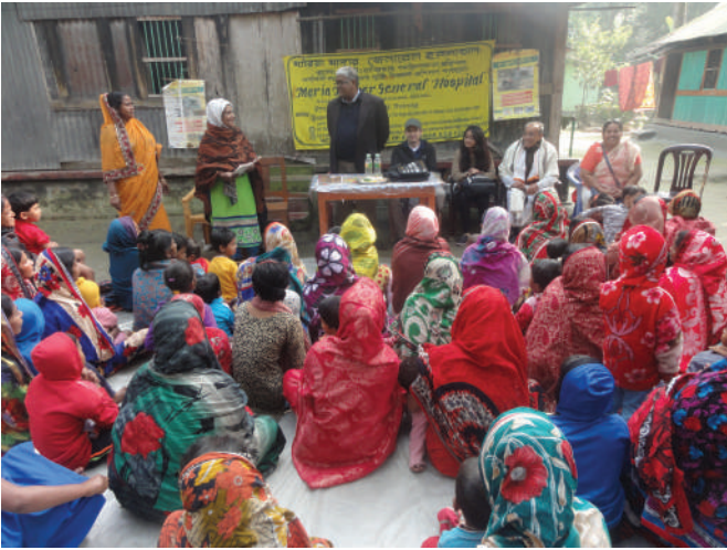
Nutrition Camp at village level