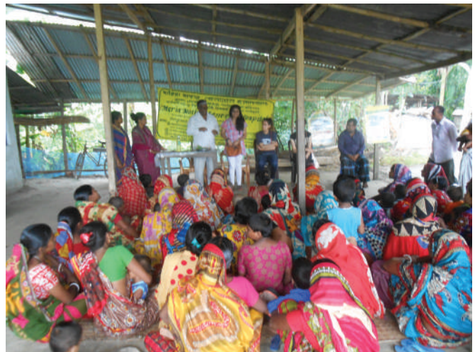
Community Health Motivators discussing with 30 mothers on Nutrition Camp.

The resistance fund one of an emergency support for medical treatment and actually who is financially stagnant and economically vulnerable or dose not affordable to manage medicine. Aloshikha has received a resistance fund from the SAKO Foundation (The Netherlands) for which vulnerable local people can overcome the emergency situation easily. In the last year we able to provided medicine for treatment and cash money among the at least 419 vulnerable people in the community.