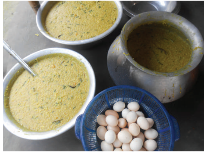
Hotchpotch cooked for malnourished children

The Aloshikha RSDC enter always gives more emphasis towards the child health care and nutrition's deficiency. The program is funded by the SAKO Foundation the Netherlands, which continue to help us to work for health motivators to address the plight and problem of child health care services at field level. In the light of their visits to take the feedback of the community based health activities through field visits with health motivators and organizing the nutrition camp in the village. This year Aloshikha was organized 12 nutrition camps at different villages among malnourished babies where 365 malnourished mothers were present during nutrition camps. We motivated to the mothers about the cause malnutrition and its consequences.