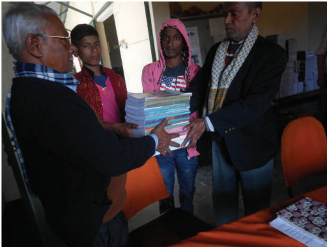
Book distribution ceremony

The Aloskha RSD Center is operating one vocational training center within its complex. The main focus of the program is to create job replacement among the rural unemployed youth, both girls and boys. Until very recently, the Center has affiliated with the Bangladesh Technical Education Board (BTEB) as an SSC Vocational Course. In respect of only four trade courses are activating, such as Mechanical, Welding Fabrication, Tailoring and dress making, and Electrical. Out of welding trade, other three trades have been approved by the Bangladesh Technical Board. According to the requirements and curricula of the technical Board, every trade course has 30 students, both girls and boys. The center has been able to convince the local unemployed youth that vocational education is only the resource for income-generating process and job facilities at national and international labor markets.