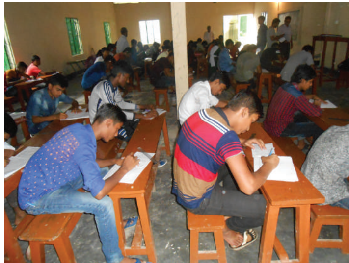
2 nd Term examination in 2018

The Aloskha Vocational Training Center is duly affiliated by the Bangladesh Technical Education Board. The Board has the responsibility to support the center as to their provision as logistic and other support. In view of book distribution, it has been completed among students of the vocational training center recently.