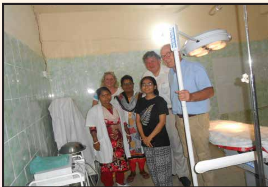
The Netherlands Plastic Surgery group