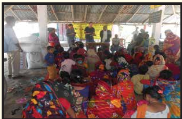
Nutrition Camp at village level children