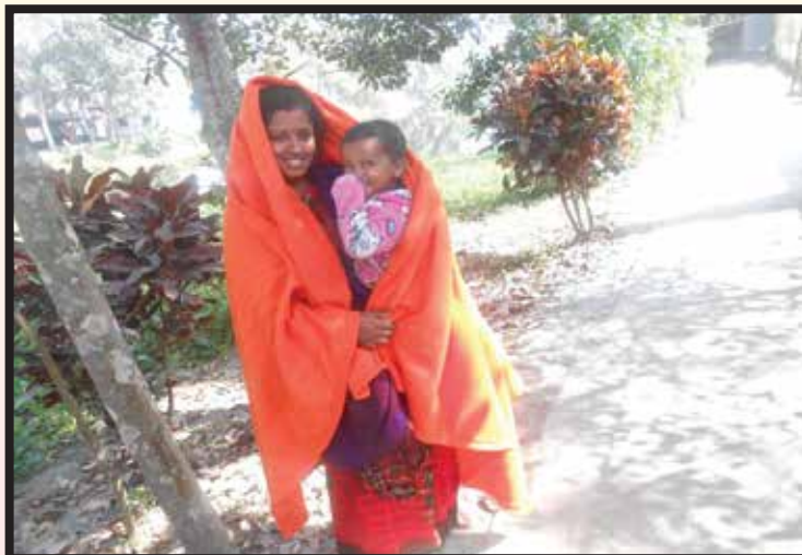
1 We program

In occasion of winter, to alleviate the sufferings of poor community, Aloskha distributed more than 100 blankets. With the fund of 1 We Netherlands, Aloskha distributed the blankets among the ultra poor people at Agailjhara, Barishal through comprehensive survey to find out the needy people.