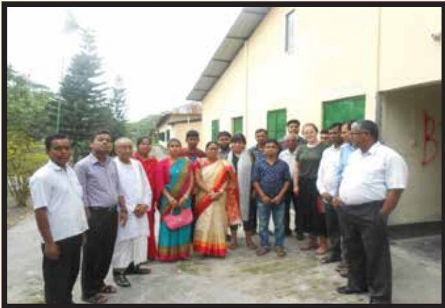
All Teacher Book distribution ceremony

The Alosikhya RSD Center is operating one vocational training center within its complex. The main focus of the program is to create job replacement among the rural unemployed youth, both girls and boys. Until very recently, the Center has affiliated with the Bangladesh Technical Education Board (BTEB) as an SSC Vocational Course. In respect of only four trade courses are activating such as Mechanical, Welding Fabrication, Tailoring and dress making and Electrical out of welding trade, other three trade courses have been approved by the Bangladesh Technical Board. According to the requirements and curricula of the technical Board, every trade course has 30 students, both girls and boys. The center has been able to convince the local unemployed youth that vocational education is only the resource for income-generating process and job facilities at national and international labor markets.