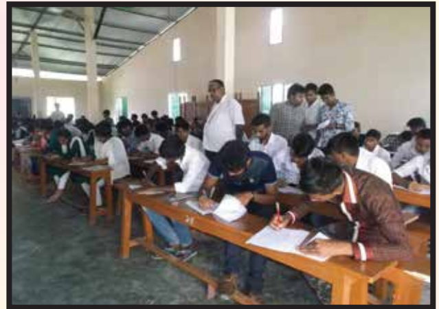
2 nd Term Examination 2019