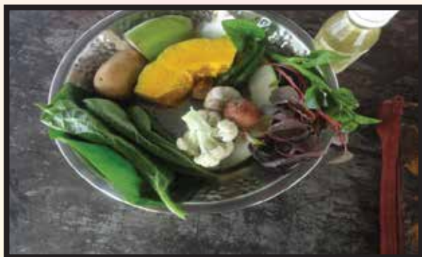
Green vegetable are processing before Nutrition camp

The Aloshikha RSD Center always gives more emphasis towards the child health care and nutrition's deficiency. The program is funded by the SAKO Foundation the Netherlands, which continue to help us to work for health motivators to address the plight and problem of child health care services at field level. In the light of their visits to take the feedback of the community based health activities through field visits with health motivators and organizing the nutrition camp in the village. This year Aloshikha was organized 11 nutrition camps at different villages among malnourished babies where 330 malnourished mothers were present during nutrition camps. We motivated to the mothers about the cause malnutrition and its consequences