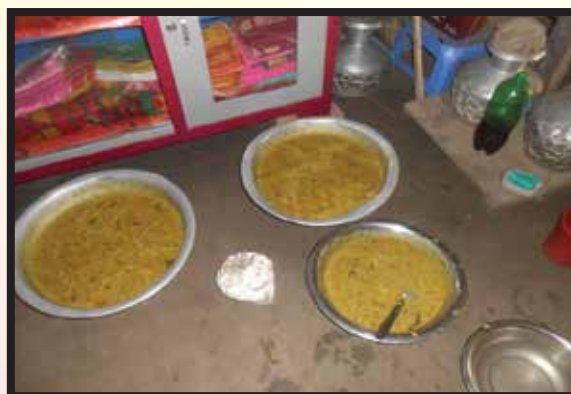
Hotchpotch cooked for malnourished

The Aloshikha RSD Center always gives more emphasis towards the child health care and nutrition's deficiency. The program is funded by the SAKO Foundation the Netherlands, which continue to help us to work for health motivators to address the plight and problem of child health care services at field level. In the light of their visits to take the feedback of the community based health activities through field visits with health motivators and organizing the nutrition camp in the village. This year Aloshikha was organized 11 nutrition camps at different villages among malnourished babies where 330 malnourished mothers were present during nutrition camps. We motivated to the mothers about the cause malnutrition and its consequences