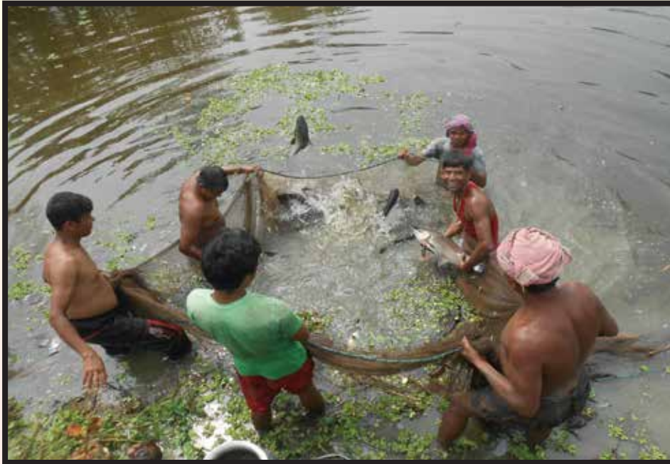
Aloshikha Fish project area

The fish play an important role in the Bangladeshi diet constituting the main and often irreplaceable animal protein source in poor rural households. The study addressed the dietary contribution of fish to vitamin A, calcium and iron intakes and the potential of integrating small indigenous fishes. In the light of the Aloshikha has undertaken fish cultivation program in its own water bodies both the high varieties and local indigenous species.