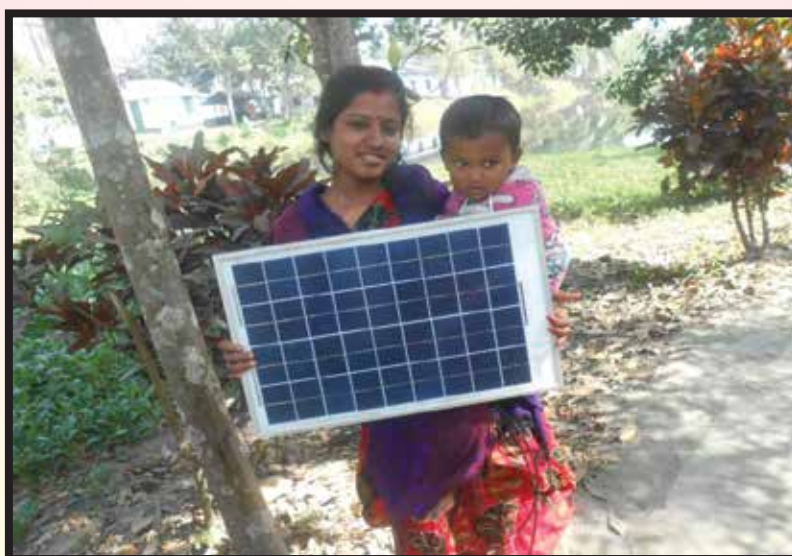
1 We program

Apart from this, Aloskha has promoted renewable energy program as such as solar home panel system due to constant load shedding from the government electric supply sectors. In terms of some off grid areas we also provided solar home system where electric supply chain is inadequate and difficult to connect electricity from the government or non government electric supply authorities, partly because of their insufficient materials and man power and limited power generation. After a study of feasibility the organization intend to establish some solar irrigation pump to ensure food security in the rural field level with joint discussion on farmers group. It is estimated that under the solar irrigation program cultivatable all land should be come in to three cropping system in a year. This year, Aloskha distributed 20 solar panel among 20 poor families in Agailjhara, Barishal, Bangladesh.