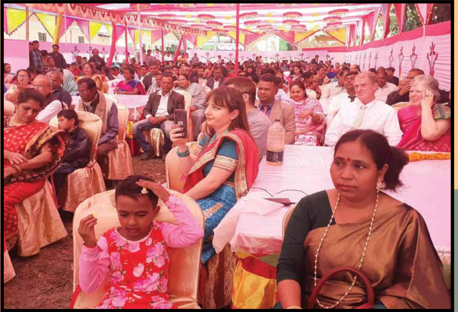
Wedding programme & Yearly Gathering at Aloskha 1st January