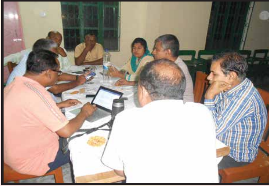
Wash Forum AGM Meeting

Aloshikha has collaboration with the wash Forum different corner membership in our country. With faith, presently they have promoted 15 organization collaboration, in the Wash activities with the individual organization. Recently, WASH the water and sanitation status of the areas and its impact on the community and environment.