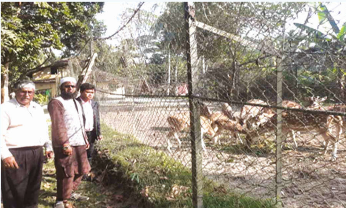
Visit to Upazila Livestock officer and ICT officer Aloshekha deer farm