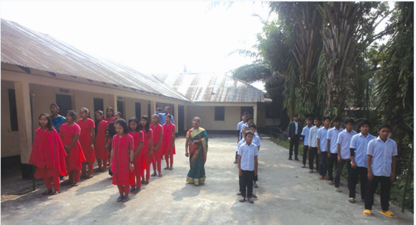
The students are in prayer at Kindergarten School.

We felt that education is important for all and without education none can take part in the nation building process. The Kindergarten education system is rather costly in rural areas, even as government primary education. The Aloshikha initially started one kindergarten school on its campus which eventually grew to three kindergarten schools in different places which are run by local supports. The main focus of the program is to ensure quality education and include creativity activities on regular basis for their cognitive development. Parents meeting are held on school premises yearly 3 times with a view to assess how they achieved quality education. In Bangladesh most Kindergarten schools are mainly academic oriented, but at Aloshikha we put emphasis on extracurricular activities among the students like painting, drawing, cultural programs on occasion of Independence day, victory day, Bangla new year etc. In addition, we raise a voice against child abuse and child trafficking and their rights, road safety and to promoting their cultural heritage.