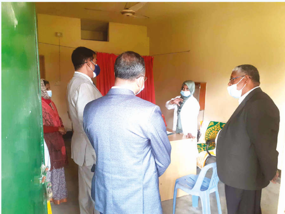
Director General of NGO Affairs Bureau is inspecting and discussing with the Gyny Doctor of the hospital