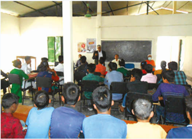
The students are attending Vocational Exam.

Book distribution, however, was completed among students of the vocational training center recently. The Chairman of SAKO Foundation recently paid visit to Aloshikha VTC and distributed books among the students. The board members of SAKO also conducted training to the students on English. The students' gifted photos on his farewell organized by the ED of Aloshikha.