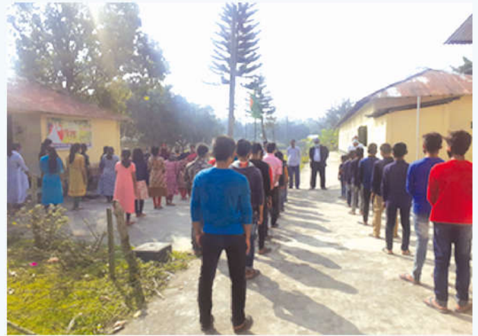
The student are in morning prayer