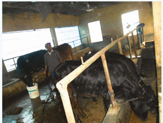
Looking after cow rearing