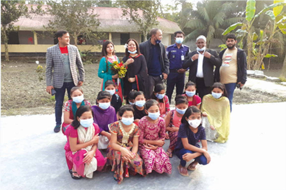
SP of Barishal along with OC (investigation) visited Alosihka office on January 1, 2022 and met some boarders of Orphanage home.