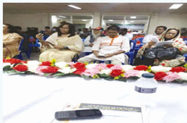
NGO Forum Coxbazer 9th November, 22