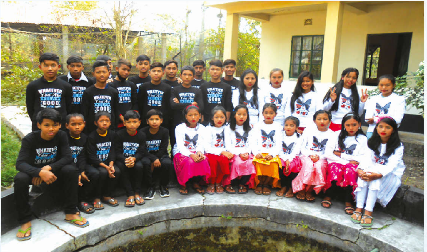
Groups picture for the orphan children