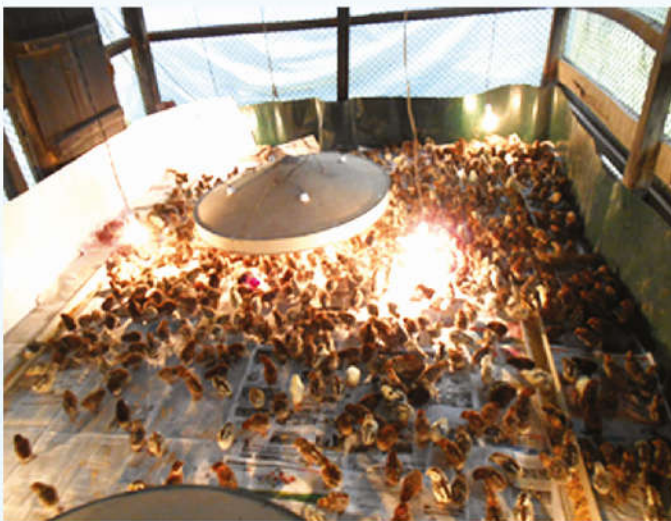
Oneday chicken raising in farm.