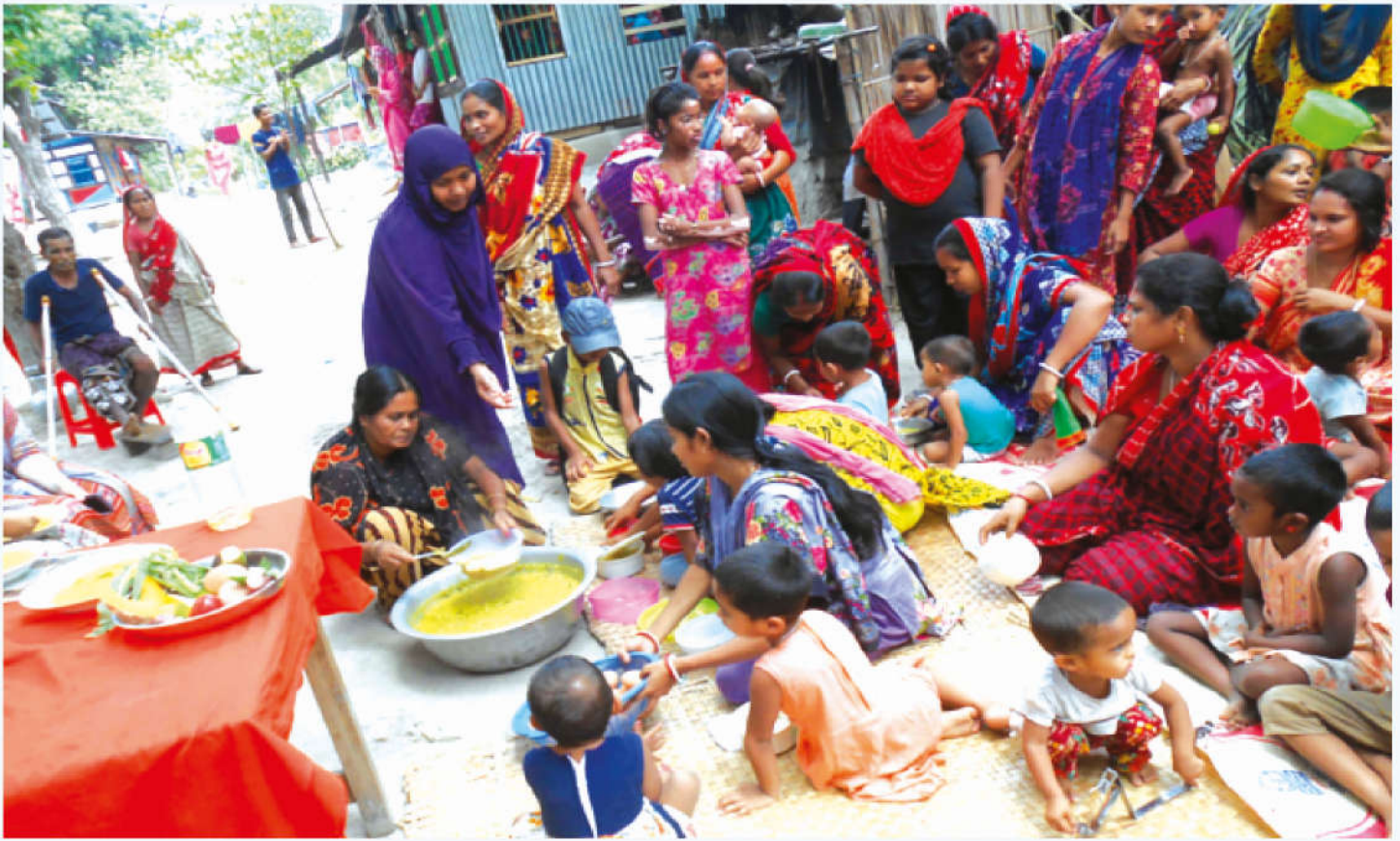
Visit to Nutrition camp

A team on 29th January 2022 visited Aloshikha RSDC Center to monitor the child health care and nutrition camp. The program is funded by the SAKO Foundation, the Netherlands. The program is to help us to work for health motivators to address the plight and problem of child health care services at field level. The visit was taken place to take feedback of the community based health activities through field visits with health motivators and organizing the nutrition camp in the village. This year Aloshikha organized 06 nutrition camps at different villages for malnourished babies where 260 mothers were also present during the nutrition camps. Aloshikha motivated to the mothers about the cause of malnutrition and its consequences.