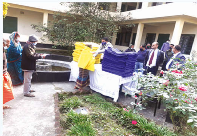
Aloshikha Program Blanket Distributed to the NGO bureau director general