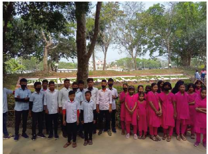
Groups picture for the orphan children