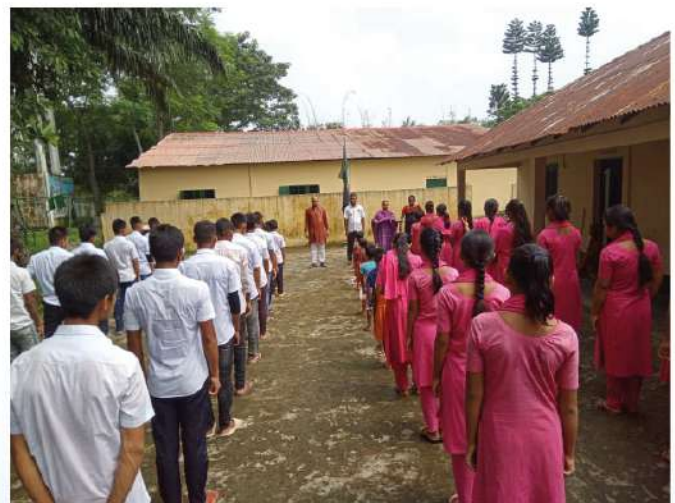
Morning assembly at the beginning of schooling

We felt that education is important for all and without education none can take part in the nation building process. The Kindergarten education system is costly compared to government primary education. The Aloshikha initially started one kindergarten school on its campus which eventually established three kindergarten schools in different places. The main focus of the program is to ensure quality education and explore creativity for their cognitive development. Parents meeting are held on school premises yearly 3 times with a view to assess how they achieved quality education. In Bangladesh most Kindergarten schools are mainly academic oriented, but at Aloshikha we put emphasis on extracurricular activities among the students like painting, drawing, cultural programs on occasion of Independence Day, victory day, and Bangla new year observation etc. In addition, we raise a voice against child abuse and child trafficking and their rights, road safety and to promoting their cultural heritage.